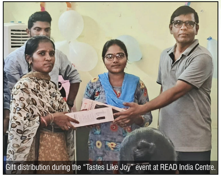
Gift distribution during the “Tastes Like Joy” event at READ India Centre.