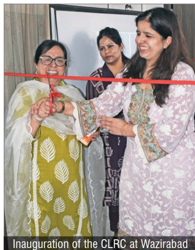
Inauguration of the CLRC at Wazirabad

On 5th April 2025, READ India inaugurated its Community Library and Resource Centre (CLRC) at the Wazirabad Centre under the banner Let's Learn and Grow. Designed for youth aged 15 and above, the CLRC provides access to over 1,000 books, a digital learning room with computers and laptops, and self-guided resources in advanced Excel and soft skills development. The centre aims to support students preparing for competitive exams, pursuing education, or building skills