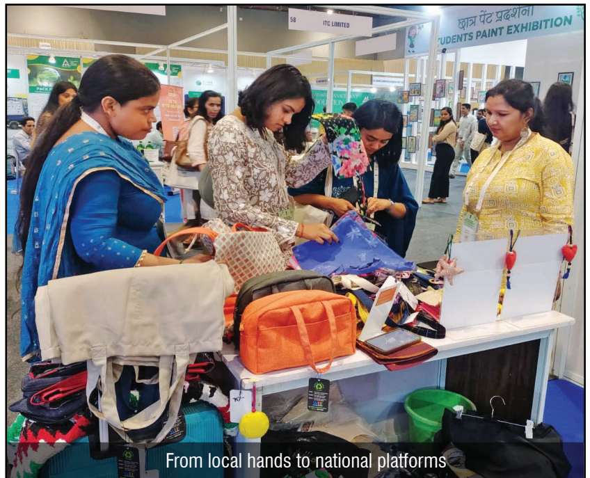
From local hands to national platforms

The expo was graced by several dignitaries, including Ms. Rekha Gupta, Chief Minister of Delhi, who visited the READ India stall and appreciated the organisation’s efforts in promoting grassroots innovation and environmental sustainability. Her words of encouragement served as a strong motivation for the team and reinforced the importance of community-led initiatives in addressing the plastic waste crisis. Participation in this national-level platform offered valuable exposure to the artisans and provided an opportunity to amplify the impact of the 3R initiative. READ India remains committed to promoting sustainable livelihoods while contributing to the larger goal of environmental conservation.