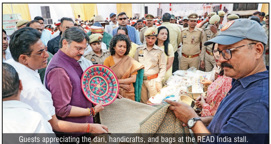
Guests appreciating the dari, handicrafts, and bags at the READ India stall.