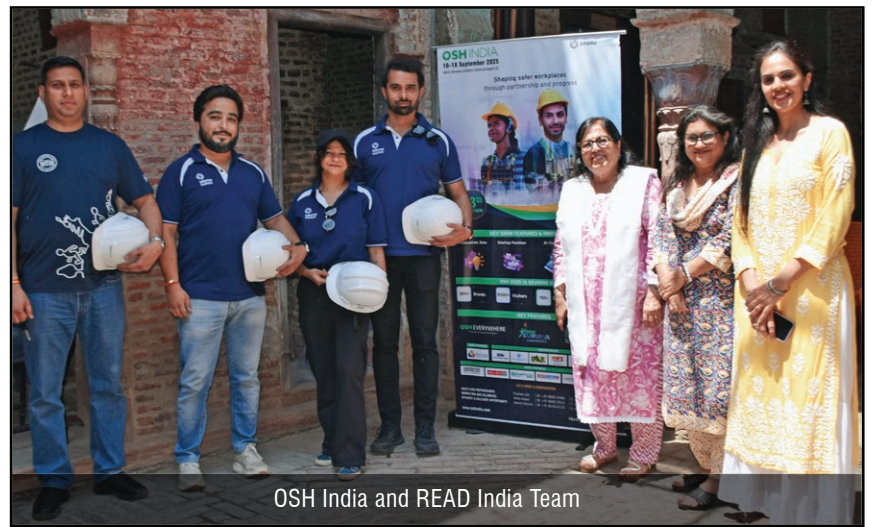
OSH India and READ India Team

These events will focus on educating communities about preventive measures, workplace safety practices and creating a culture of safety at the grassroots. Gloves and reflector jackets will also be distributed to reinforce safe work practices and promote dignity, health and protection.