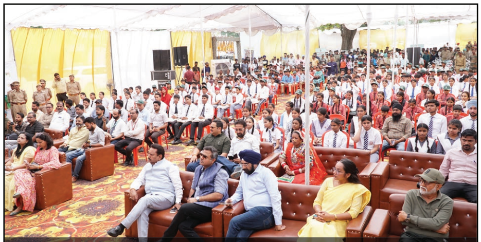
Audience at the event supporting environmental awareness and community initiatives