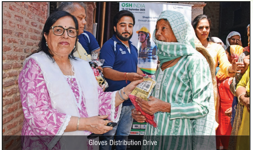
Gloves Distribution Drive

On the occasion of Labour Day, READ India with OSH India and with generous support from MN Rubber extended a meaningful gesture toward improving the occupational health and safety of women in Jhajjar, Haryana. As part of the initiative, rubber gloves were distributed to women engaged in the preparation of cow dung cakes which is a traditional livelihood practice that often exposes them to foodborne illnesses, skin infections, and hygiene-related risks due to direct contact with raw materials. By providing protective gear, we aim to promote safer and healthier working conditions for these women, reinforcing our collective commitment to dignity, safety and well-being in rural livelihoods.