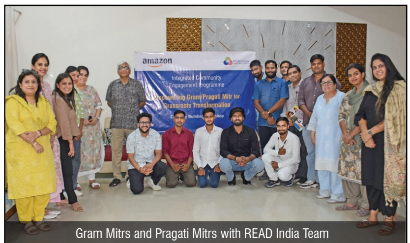
Gram Mitrs and Pragati Mitrs with READ India Team