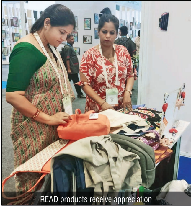
READ products receive appreciation

On the occasion of World Environment Day, celebrated on 5th June 2025, the Ministry of Environment, Forest and Climate Change hosted a National Expo on “Eco Alternatives to Banned Single Use Plastics and Plastic Waste Management” at Bharat Mandapam, New Delhi. The event brought together organisations and innovators from across the country committed to promoting sustainable alternatives and effective waste management practices. READ India actively participated in the expo, showcasing a range of eco-friendly products developed under the organisation’s 3R Project (Reduce, Reuse, Recycle). These handmade items, crafted using recycled materials, not only highlighted the creativity and skill of community members but also offered sustainable alternatives to plastic-based products. The stall attracted considerable attention and support from attendees, with several products being sold during the event, reflecting growing consumer interest in environmentally conscious alternatives.