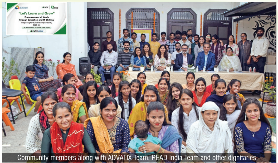
Community members along with ADVATIX Team, READ India Team and other dignitaries

community to make full use of the Centre's facilities. A brief media interaction highlighted Advatix's commitment to long-term youth development. The CLRC stands as a significant step toward creating inclusive, community-driven spaces for learning, growth, and opportunity