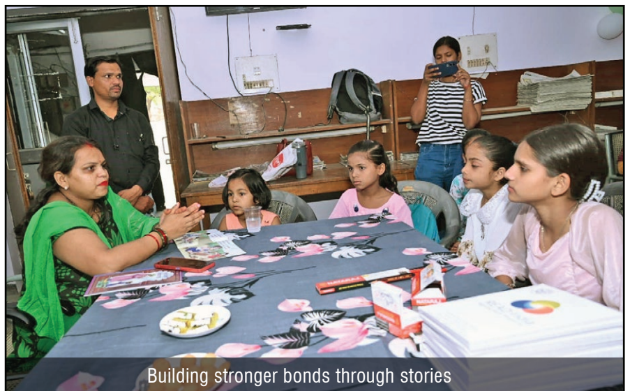
Building stronger bonds through stories

On 15th May, READ India's Community Library in Lucknow, celebrated Mother's Day with warmth and enthusiasm. Primary and secondary school teachers were invited to the library, where they encouraged students to express their feelings by making handmade cards and writing poems for their mothers. The celebration provided a joyful platform for children to reflect on the role their mothers play and to honour them through creativity and emotion. It was a beautiful reminder of the unconditional love and quiet strength that mothers embody every day.