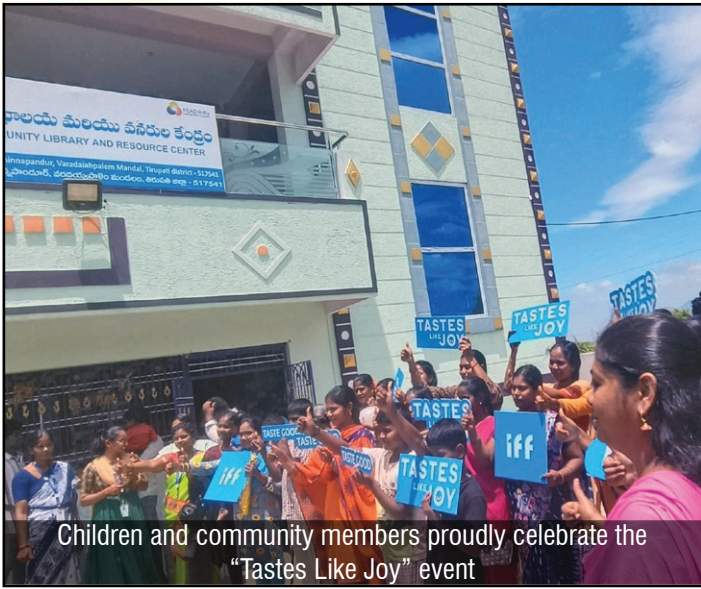
Children and community members proudly celebrate the “Tastes Like Joy” event