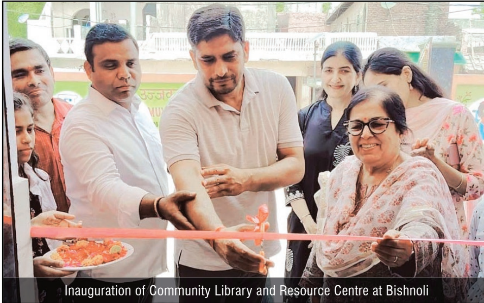
Inauguration of Community Library and Resource Centre at Bisnoli