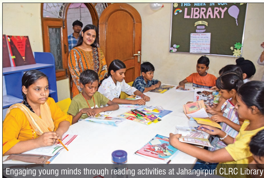
Engaging young minds through reading activities at Jahangirpuri CLRC Library

READ India, with the support of HT Parekh Foundation, proudly launched a transformative Community Library initiative aimed at bringing the joy of reading and digital learning to underserved communities. This vibrant network of libraries operates across four key locations: Bisnoli and Lucknow in Uttar Pradesh, Wazirabad in Haryana, and Jahangir Puri in Delhi. These libraries are more than just rooms filled with books, they are inclusive, safe, and child-friendly spaces designed to spark curiosity, creativity, and confidence among children and youth. With a curated collection of age-appropriate books and access to digital tools, the initiative offers engaging library activities, storytelling, and guided learning opportunities that encourage consistent reading habits and digital literacy. READ India envisions these libraries as community hubs for