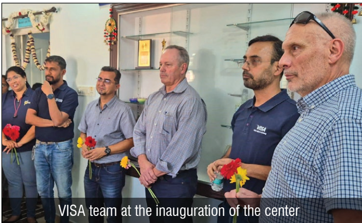
VISA team at the inauguration of the center

In a warm gesture of engagement, the guests from VISA enthusiastically participated in a bangle-making activity, interacting with the women and gaining first-hand experience of the skill-based training imparted at the center. This initiative aimed to provide marginalised women with education, financial literacy, and livelihood skills, empowering them to pursue sustainable income-generation opportunities. The event symbolized the shared commitment of VISA and READ India toward building resilient, self-reliant communities, with a focus on women’s empowerment, financial inclusion, and sustainable development.