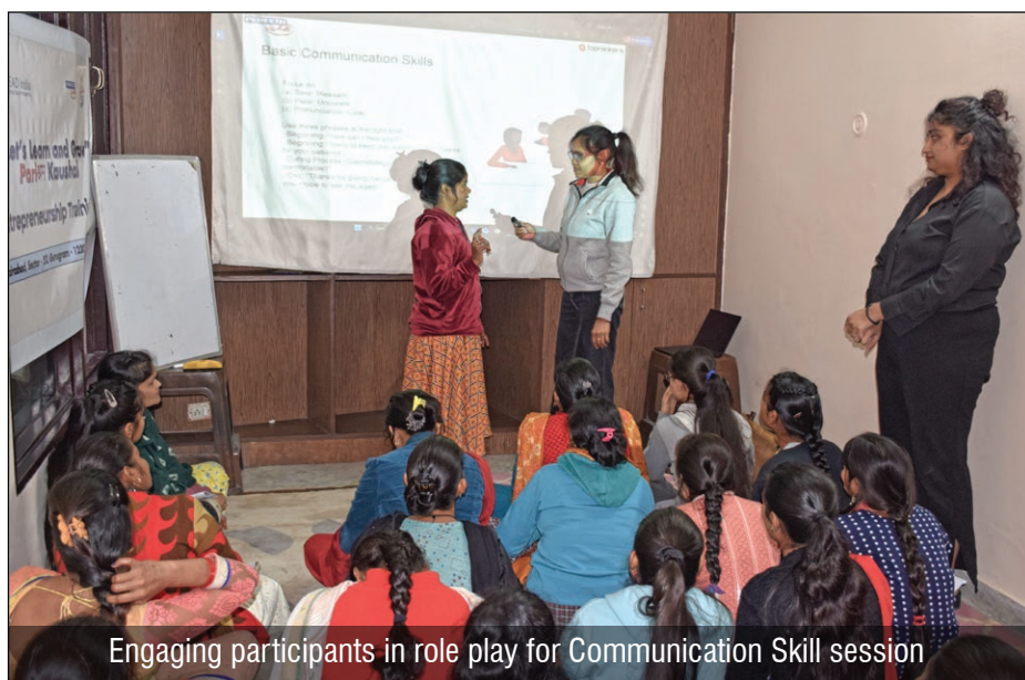
Engaging participants in role play for Communication Skill session

Midway through the program, participants were guided on Building Predictability and Reputation, an essential trait for any successful business. These concepts were reinforced with role plays that illustrated practical ways to earn trust, retain customers, and uphold credibility. An Accounting Tool module introduced participants to basic financial literacy, covering account keeping, budgeting and profit and loss tracking. This hands-on session empowered women with tools to manage their small businesses effectively and sustainably. The training concluded with a high-energy session on Team Building, emphasizing the importance of assembling the right team, understanding team dynamics and fostering collaboration.