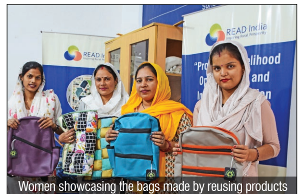
Women showcasing the bags made by reusing products