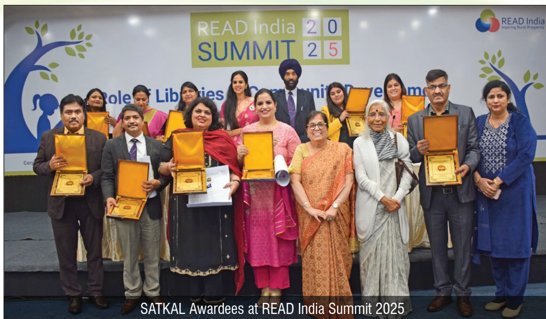
SATKAL Awardees at READ India Summit 2025

One of the key highlights of the summit was the recognition of a dedicated READ librarians who were honored with the SATKAL Lifetime Achievement Award for their exceptional work in strengthening rural communities and promoting higher education among girls. Their story, among others shared at the summit, inspired participants and highlighted the quiet revolutions being led by grassroots changemakers.