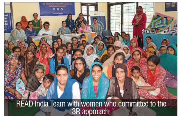
READ India Team with women who committed to the 3R approach

By bringing sustainable skilling directly to underserved rural locations, READ India ensures that women at the grassroots are equipped with the tools to build self-reliant futures. The initiative also promotes community-led environmental responsibility, where each product created is a step toward reducing agricultural waste and promoting circular economy practices. This program reflects READ India’s holistic vision: empowering women, preserving the environment, and building inclusive rural economies.