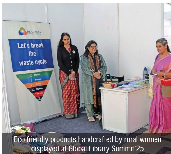
Eco friendly products handcrafted by rural women displayed at Global Library Summit'25