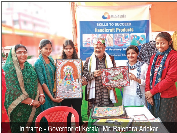
In frame - Governor of Kerala, Mr. Rajendra Arlekar