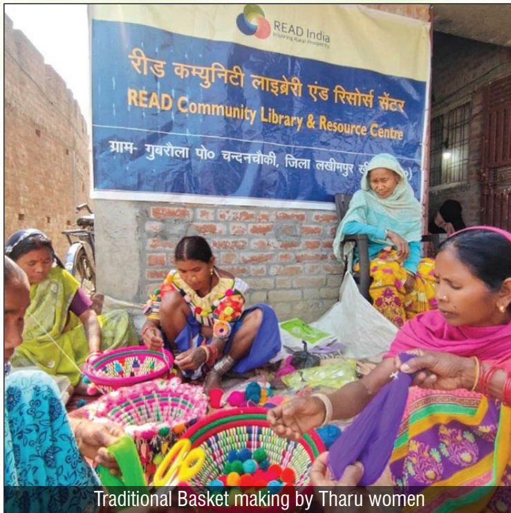
Traditional Basket making by Tharu women

The women in the villages of Lakhimpur Kheri are skilled on weaving, basket making and other related skills. READ India is conscious of empowering them and educating them on the government welfare schemes and how they can get benefits of the government schemes by registering them in a group or individually too.